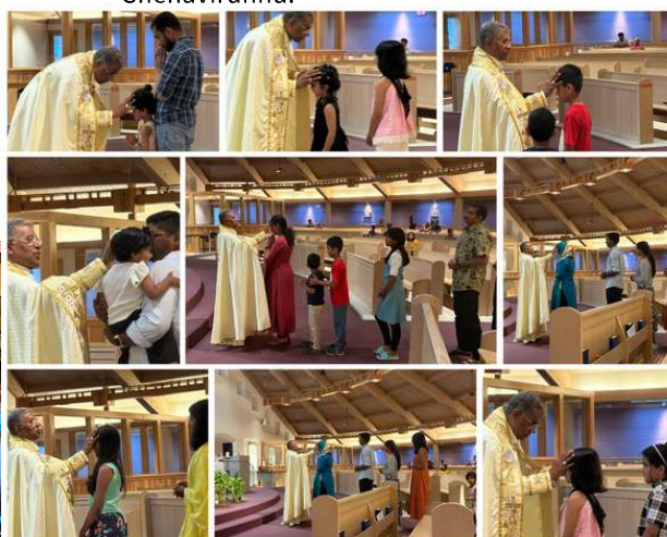
July 26: Pithaavu blessing our parishioners