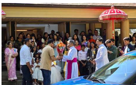
Official welcome for Pithaavu