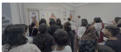
Novena at Mission house