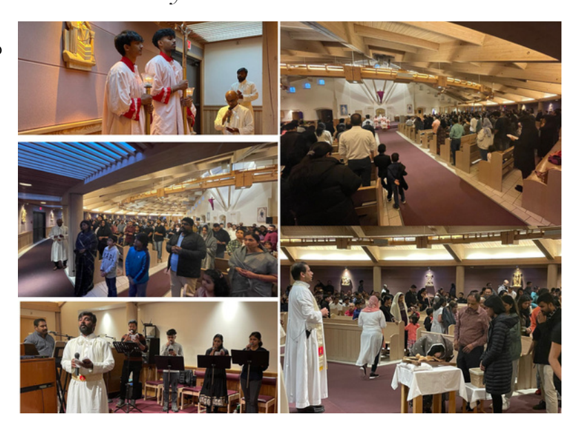
Good Friday @ Carmel Hill, Deroche