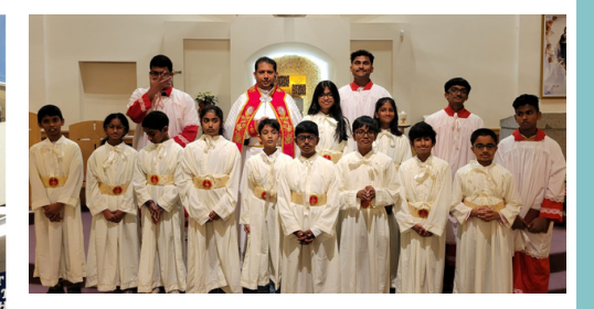
A sacred vestment ceremony was conducted on November 26 to warmly welcome all our new altar servers